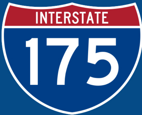
I-175 Crash Heat Map (2020—2024)