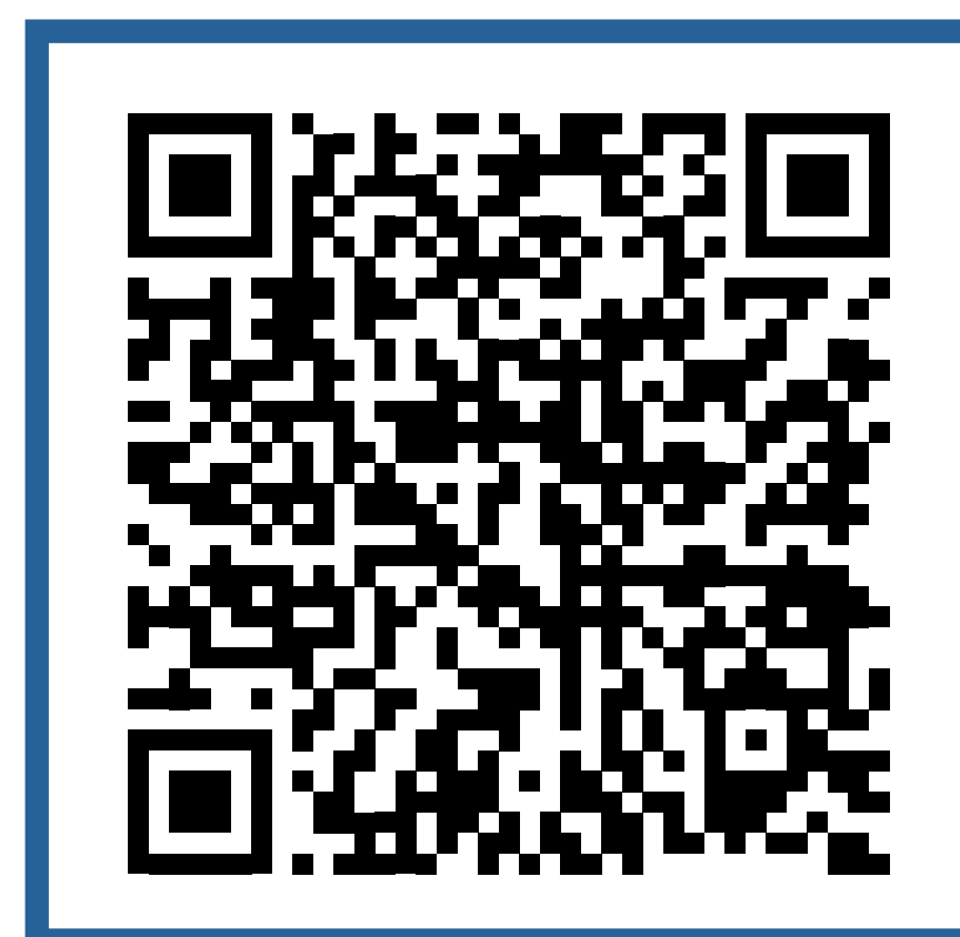
Scan for McIntosh Road Project Website

Must be electronically submitted or postmarked by November 25, 2024 to become part of the official public hearing record