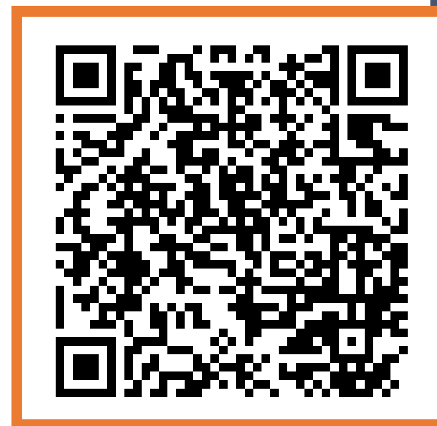
Scan for Branch Forbes Road Project Website