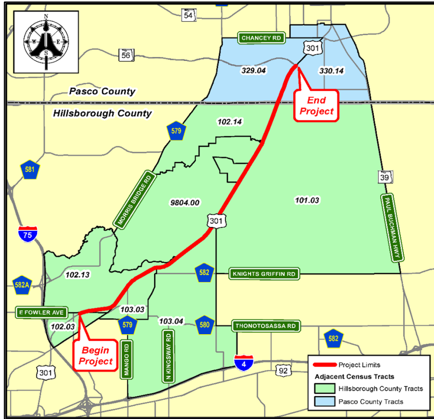
Figure 2: Project Census Tracts (2010)

Minority groups with the highest percentages within the project limits include Hispanic (12.7% in Hillsborough County, 5% in Pasco County) and African American (8.4% in Hillsborough County, 4.7% in Pasco County). Project newsletters will be made available in Spanish upon request. All efforts will be made to notify any Spanish-speaking interest groups and residents within the project area.