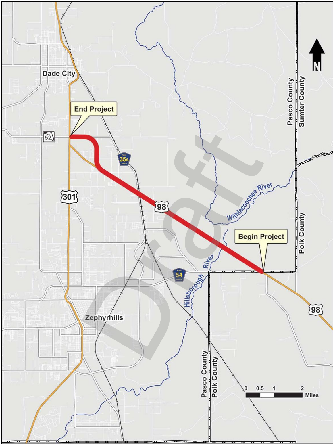
Figure 1-1 Project Location Map